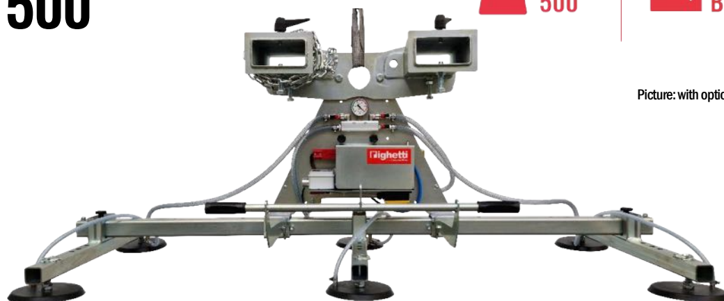
Picture: with optional forklift adaptor

The sheet metal vacuum lifter F6B is battery powered by high capacity rechargeable batteries (battery charger is included). F6B 500 has a maximum capacity of 500 kg and 6 suction pads distributed on 3 cross-arms. The pads, equipped with springs, are made of special oil-resistant vulcanized rubber , specific for sheet metal.